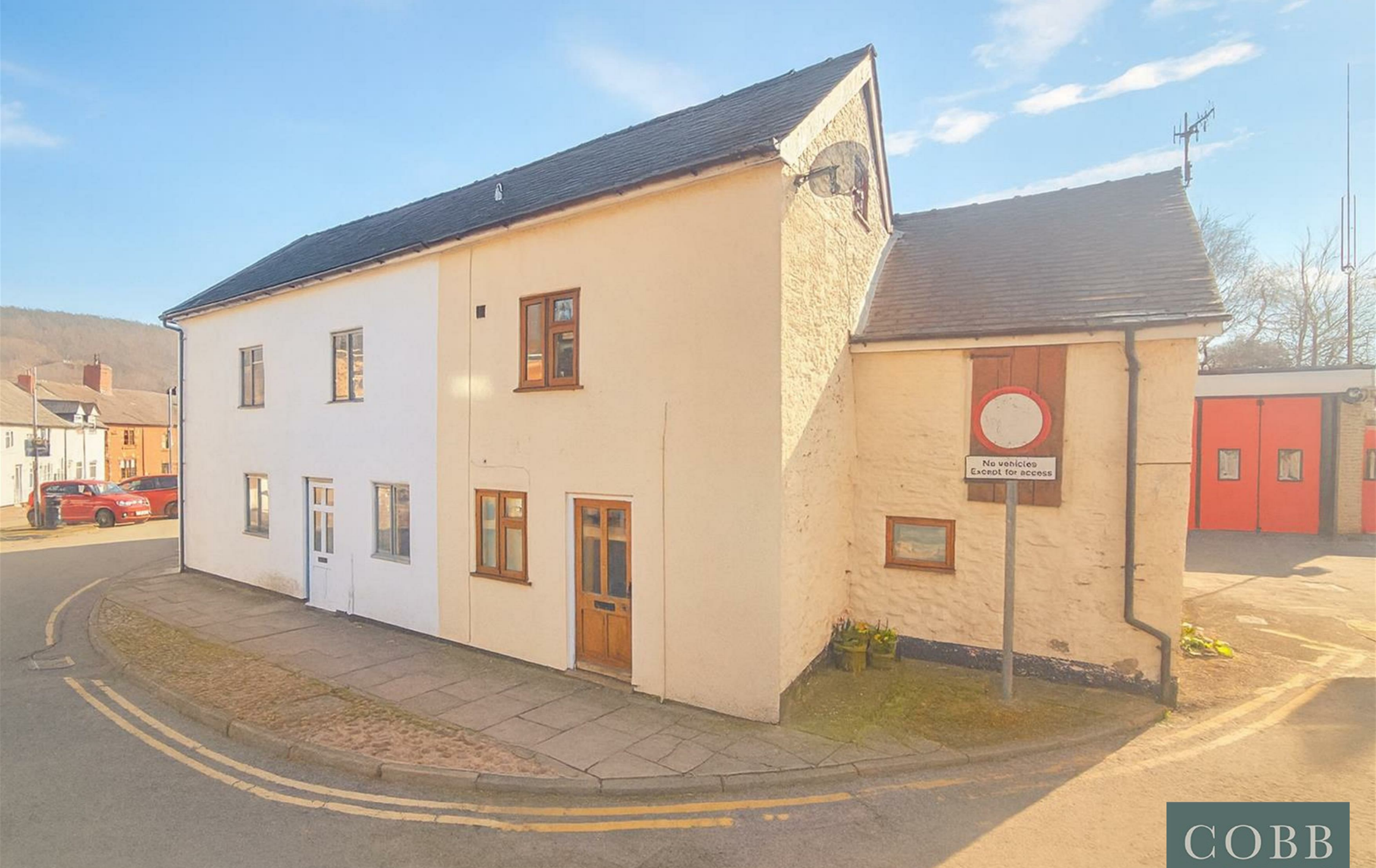
41, Market Street, Knighton, LD7 1EY Price £165,000